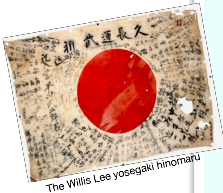
The Willis Lee yosegaki hinomaru